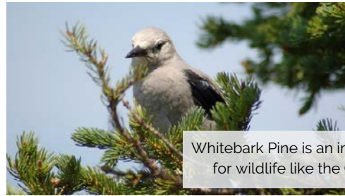
Whitebark Pine is an important food source for wildlife like the Clark's Nutcracker.

-The Clark's nutcracker and the whitebark pine have co-evolved together for millennia. Nutcrackers cache whitebark pine seeds in recently-burned areas and are the only way that seeds are dispersed.