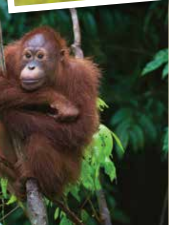
Above: Young Sumatran orangutan; Left: Black-throated green warbler