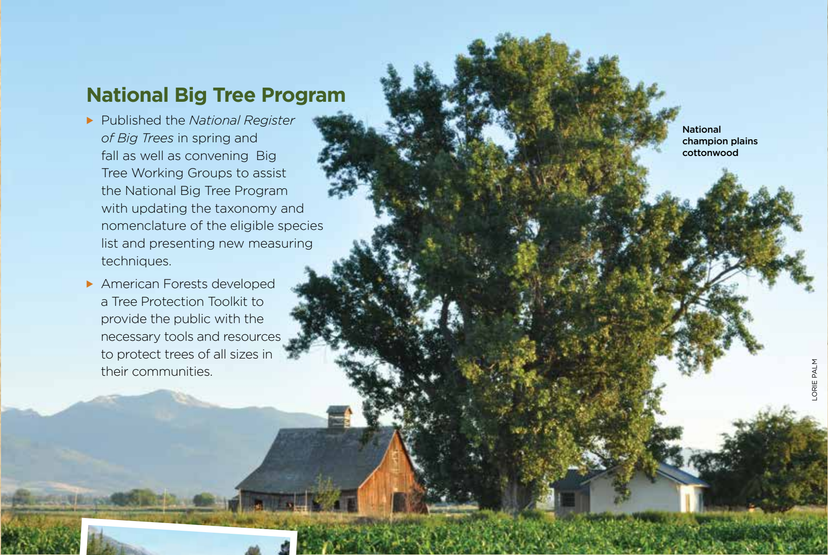
National champion plains cottonwood