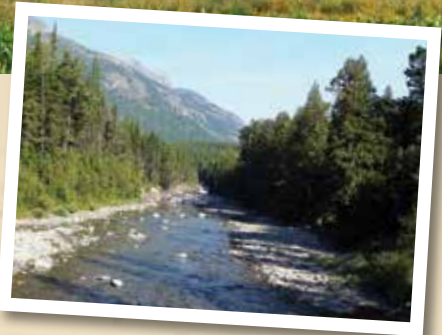
The Land and Water Conservation Fund has protected land in every U.S. state.