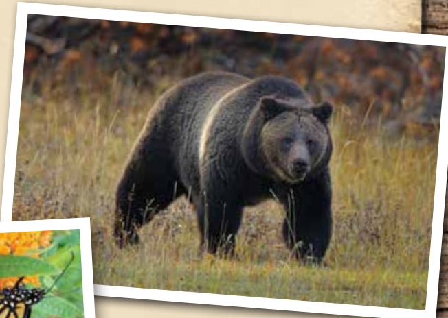
Above: Grizzly bear; Left: Monarch butterfly