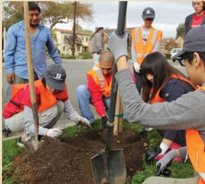
Community ReLeaf tree planting in Pasadena